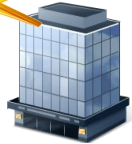
QTS Operations Center