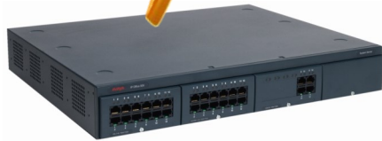
QTS PURCHASED IP OFFICE