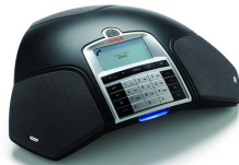
OP-X Acquisition Model

QTS connects client's office to private network.